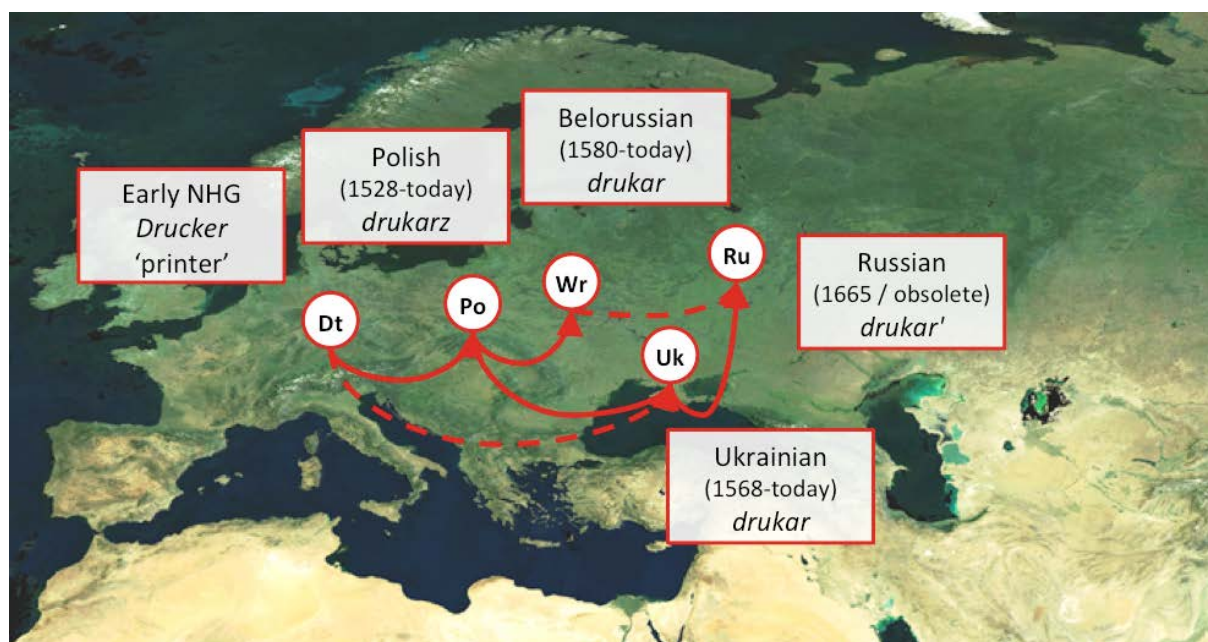
Figure 2: Possible borrowing paths of German Drucker 'printer' into the East Slavic languages.

Borrowing chains are the premier raison d'être for the graph-based data modeling in the Lehnwortportal . Figure 2 (below) shows, if only in a highly schematic fashion, the sample case of German Drucker 'printer' that has entered the East Slavic languages mostly through Polish. The different pathways obviously form a small directed graph that can be added more or less directly as a new subgraph to the portal data graph. The dashed arrows indicate less likely borrowing pathways; correspondingly, edges in the portal graph may be assigned weights to indicate likelihood of a borrowing relation and to calculate rankings of search results. Note that there are three different paths in this subgraph all leading from the German etymon Drucker to the Russian loanword drukar' .